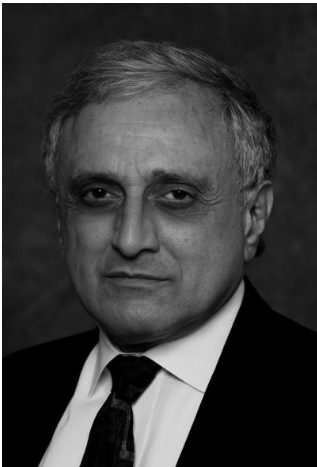
After years of decay and instability, school board members voted to repair Paladino's face.

Maintenance crews will begin work face-wide this summer. Paladino's dark, concaved